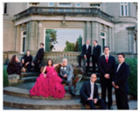
Essential Portland bands