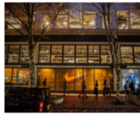
Sneaker culture in Portland