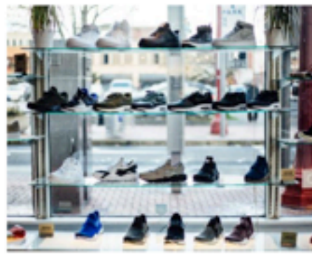
The Portland sneakerhead scene