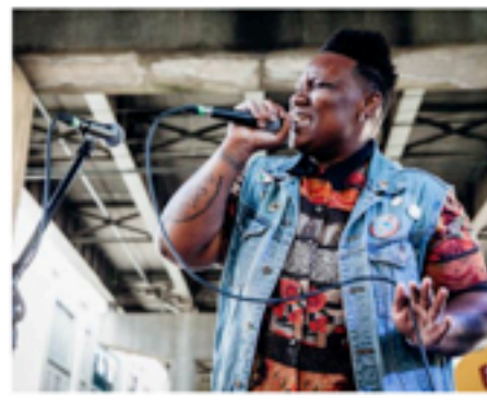
The Portland hip-hop scene