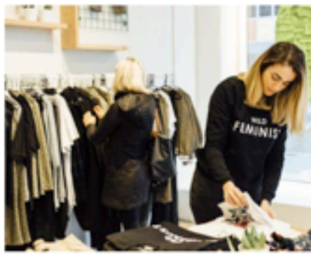
Portland streetwear shops