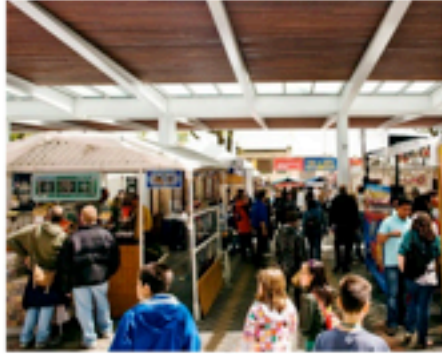
Old Town Chinatown shopping