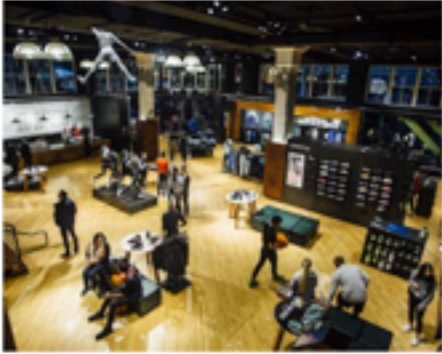
Portland shoe and sportswear brands