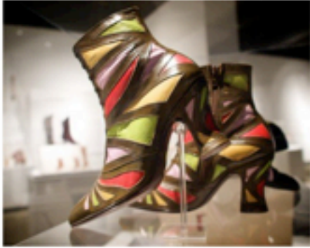
Shoe shopping in downtown Portland