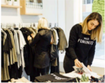
Portland streetwear shops