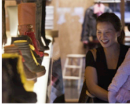
Tax-free shopping in Portland