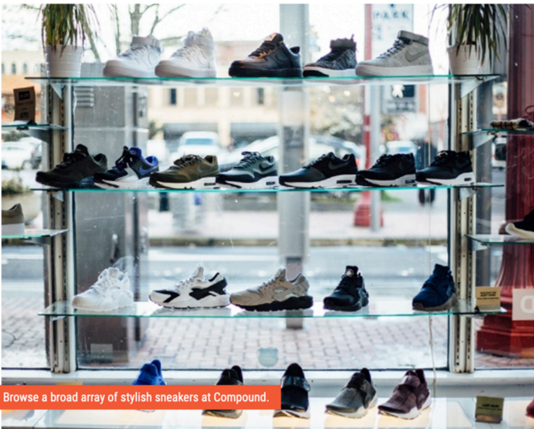
Browse a broad array of stylish sneakers at Compound.